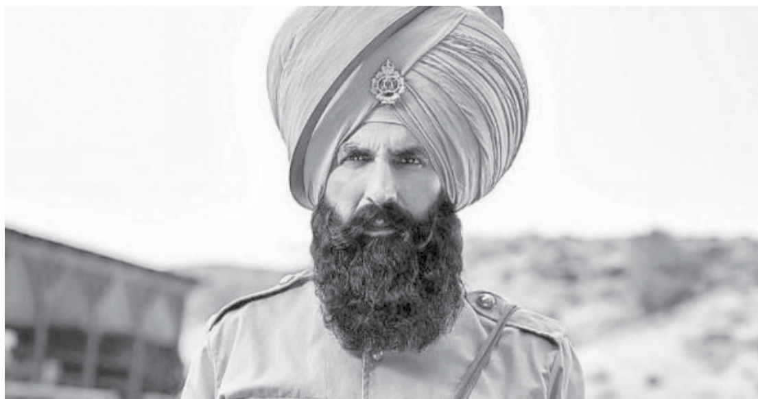
Akshay Kumar in a still from Kesari

It follows the events leading to the Battle of Saragarhi, a battle between 21 soldiers of the Sikh Regiment of the British Army and 6,000–10,000