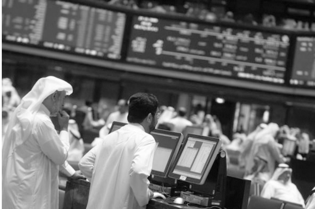
Traders on the floor of Saudi Stock market (file)

with most of its financial stocks gaining.