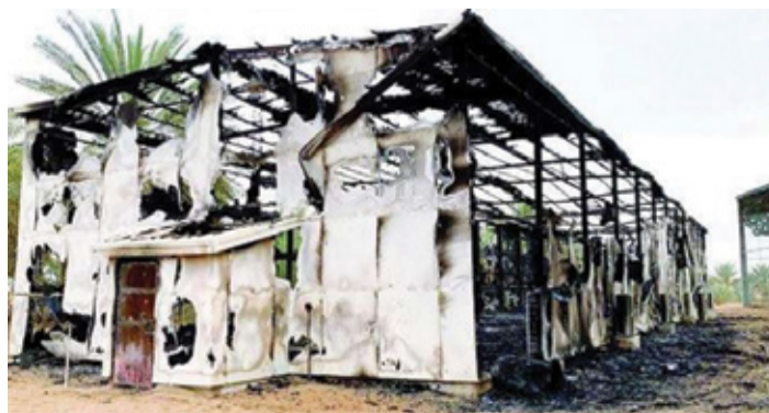
The burned farm, and right, charred remains of the rare falcon chicks.

One of the birds was a famous competition winner val-