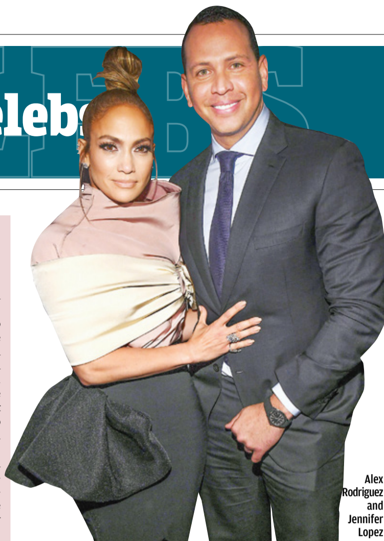
Alex Rodriguez and Jennifer Lopez