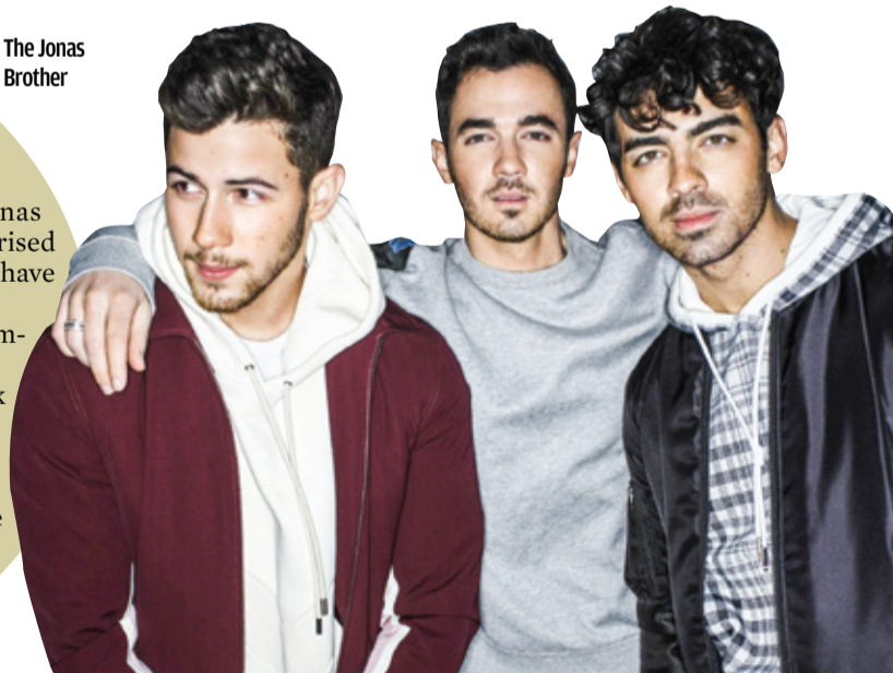
The Jonas Brothers

Nick also uploaded a photo of himself looking off into the distance and captioned it "shooting something."