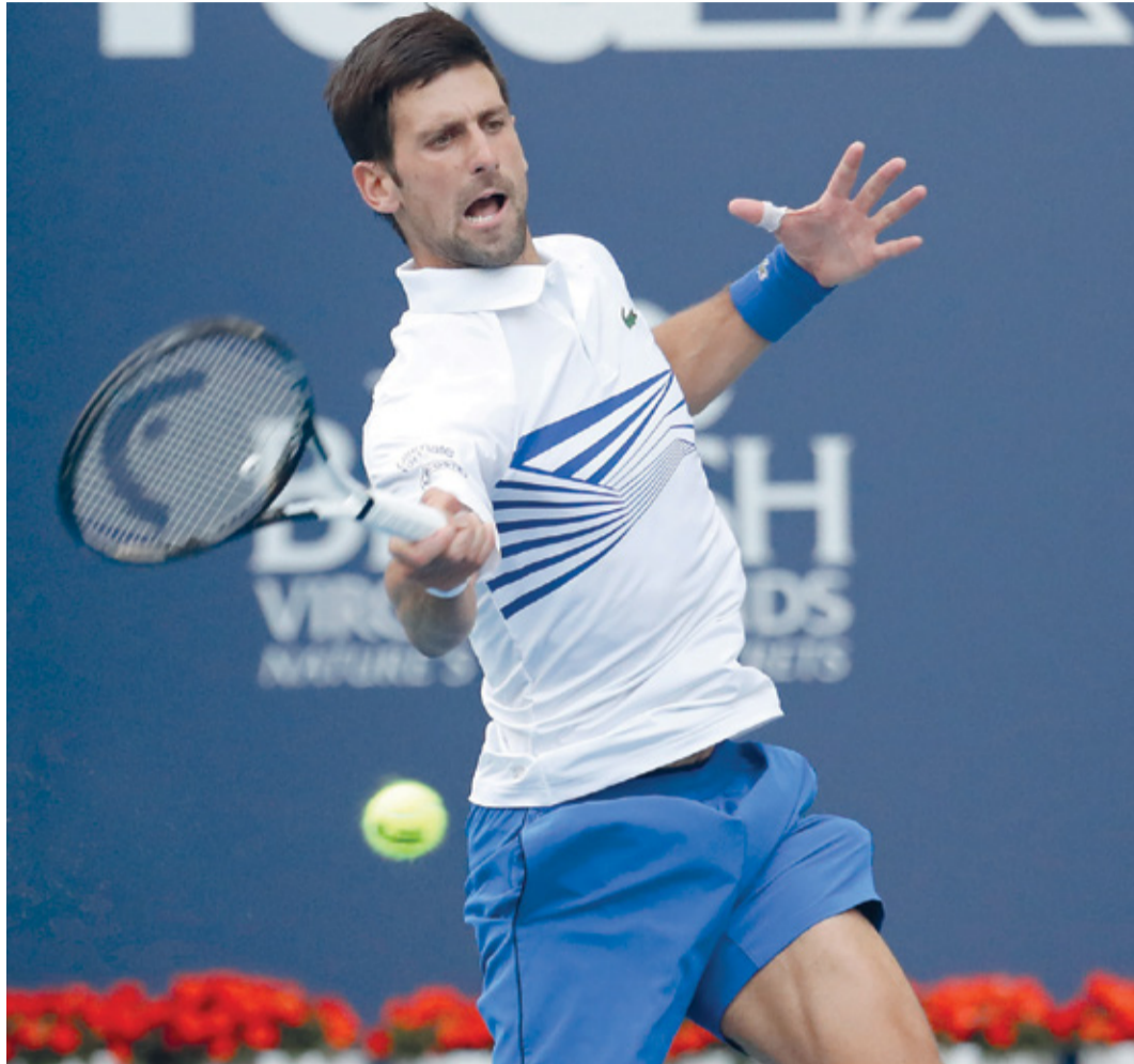
Novak Djokovic of Serbia returns a shot to Federico Delbonis of Argentina

"To be honest, I lost my focus," said Djokovic who smashed 36 winners compared to 24 from Delbonis. "I should have done