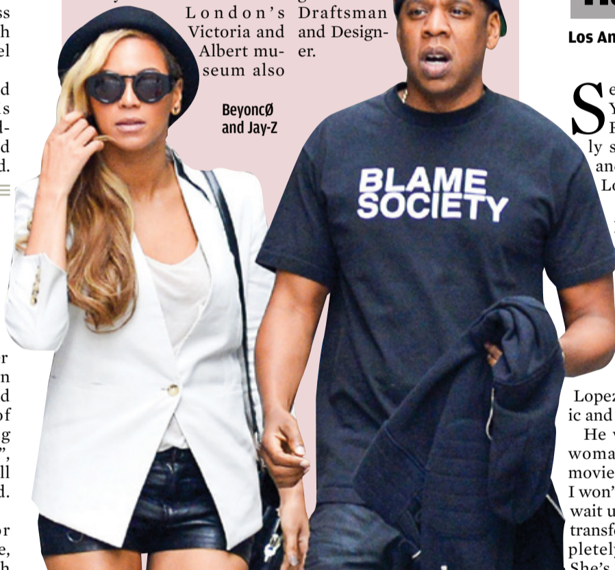
Beyoncé and Jay-Z

The second most popular exhibition in 2018, which attracted more than 700,000 visitors, was Michelangelo: Divine Draftsman and Designer.