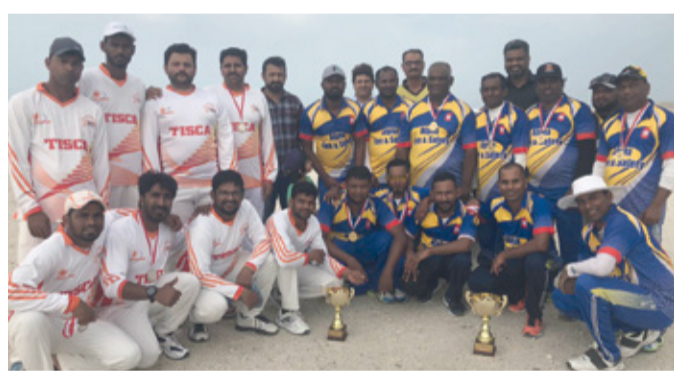
CBA 8 A side tournament for Division D winners Alpha Fire and runners up TISCA Stars with their trophies

"Their expertise will definitely help to inspire upcoming talents, encourage more players to train seriously and I hope that we will see sustained and increased interest in the sport over the years," he said.