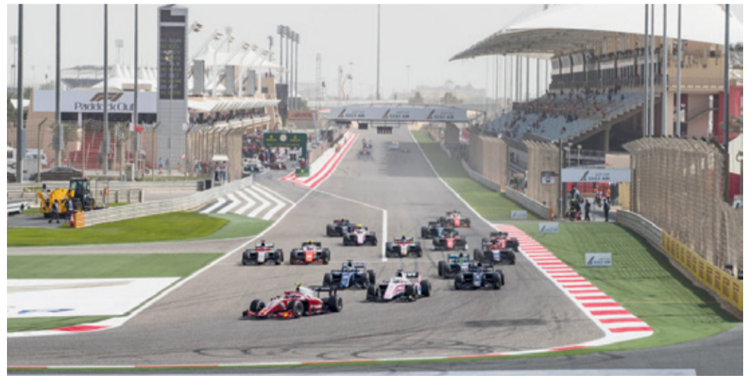
F2 cars in action at BIC

It was also announced that 20-year-old Schumacher will be making his debut in a Formula 1 car in Bahrain at a young driv-