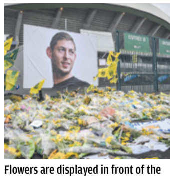
Flowers are displayed in front of the portrait of Emiliano Sala at Beaujoire stadium in Nantes (file photo)

The 28-year-old Argentine forward was killed when the small plane carrying him came down in the Channel on January 21, two days after he completed his transfer from the French