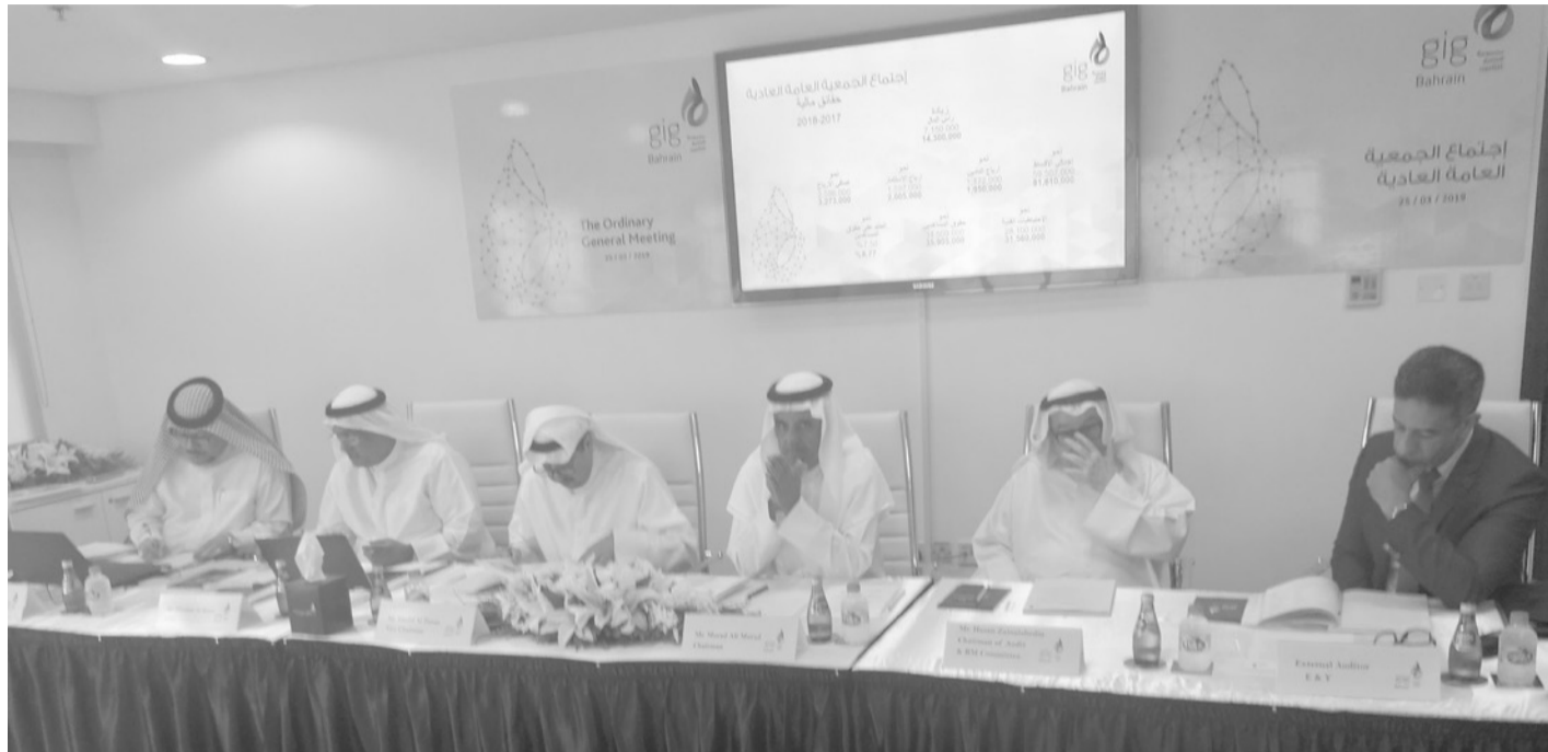
Board members and top officials of Bahrain Kuwait Insurance Company during its Annual General Meeting held yesterday

The company, the Chairman said, had increased its stake in Takaful International through