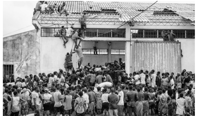
People take part in the looting sacks of Chinese rice printed "China Aid" from a warehouse which is surrounded by water after cyclone hit in Beira, Mozambique

The South African military have deployed several aircraft to the affected area and an EU-funded World Food Programme chopper is supporting rescue and recovery efforts.