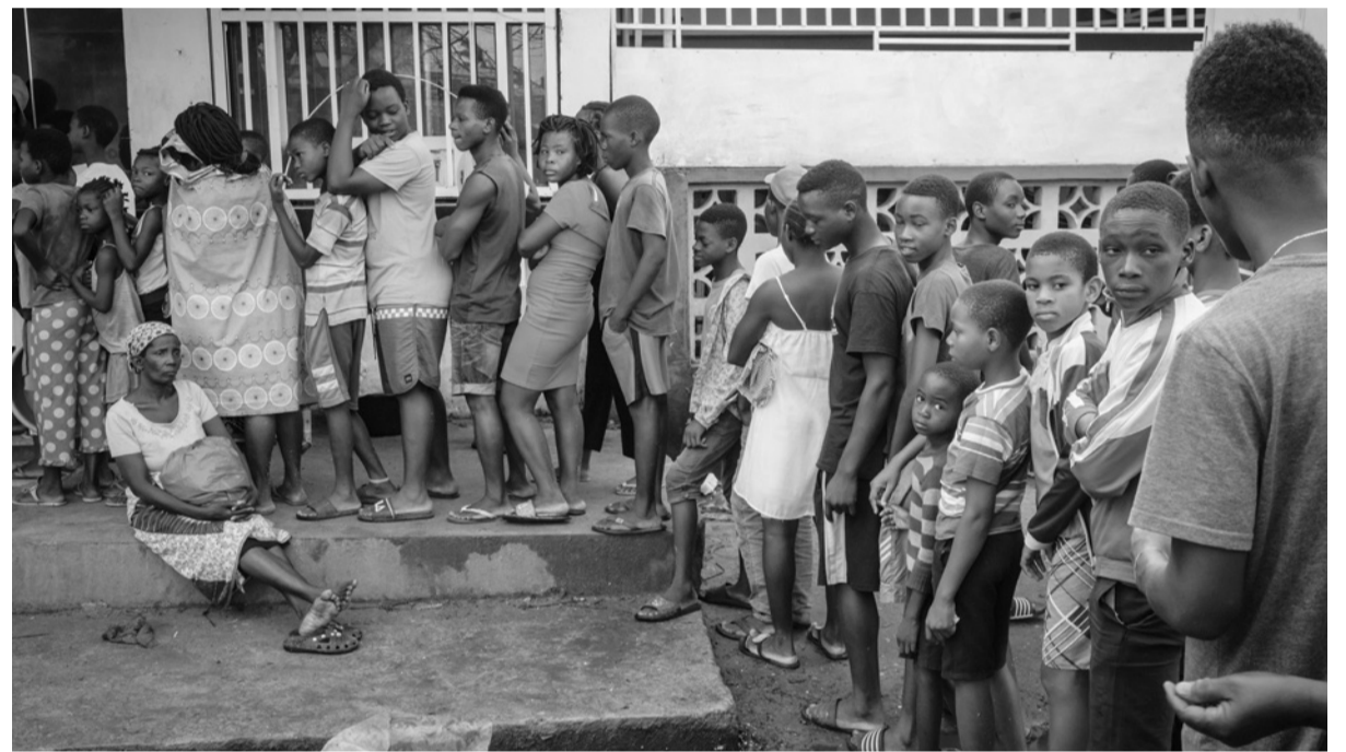
People queue to buy breads in Beira, Mozambique