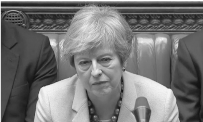
Britain's Prime Minister Theresa May listen as opposition leader Jeremy Corbyn speaks in the House of Commons in London

May said the government would provide time to allow MPs to debate and vote on Brexit alternatives to find a plan that