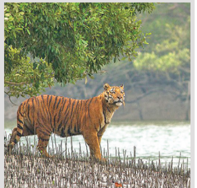
A Bengal tiger in the Sundarbans

The Sunderbans species attract tourists around the world. They come to carry out scientific research as well as observe the diverse species of both plants and animals. Conservation efforts are implemented to keep the Sundarbans safe from illegal hunting and other human activities like agriculture. The government has passed a law to protect the ecosystem and maintain the biodiversity. Although the tourism sector is affected by impassable roads, several measures including investment in infrastructure are underway. Although there are protection efforts, the topography of the region and the hostile terrain and the international border makes it difficult to monitor and control poaching and woodcutting of the mangrove trees. The Sundarban Tiger Reserve is also face numerous challenges in managing wandering Tigers, and reports of human-tiger conflicts are quite frequent.