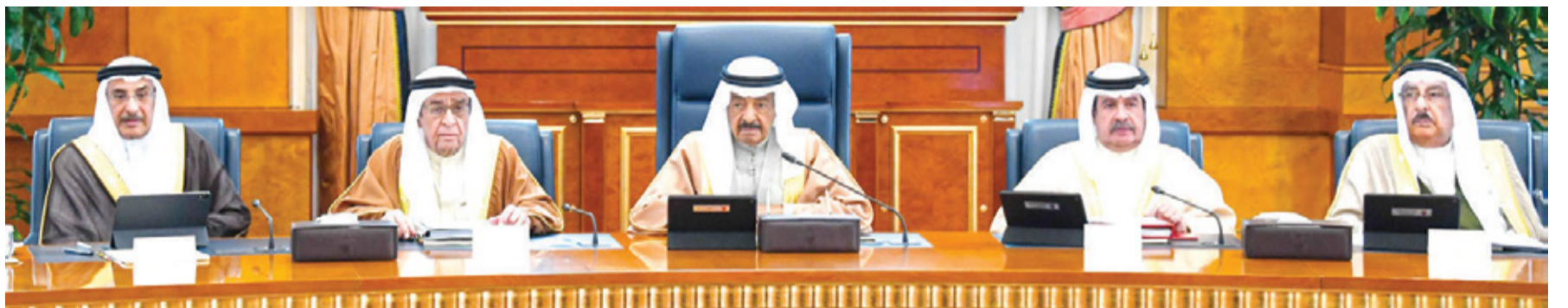
HRH the Premier chairs the Cabinet.

High-level committee to investigate into allegations of two girls selling drugs at school