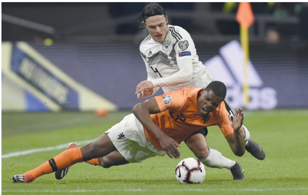
Netherlands' defender Denzel Dumfries (front) vies with Germany's defender Nico Schulz

The four-time world champions were put under immense pressure from a Netherlands side seeking a winner but the visitors, who were booed by their own fans in a 1-1 friendly draw against Serbia last