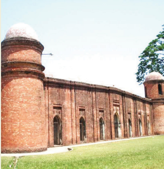
View of the historic Shat Gombuj Mosque

The Mosque City in Bargehat is located where the River Brahmaputra and Gangel meet. It was inscribed as a World Heritage Site in 1985. The city was founded by a Turkish-born Ulugh Khan Jahan in the 15th century and was built using bricks. Forbes categorizes the city as one out of the fifteen lost cities of the world. The city is a tourist destination, and some of its former structures include 360 mosques, mausoleums, roads, bridges and other public buildings constructed from baked bricks. However, the city was in ruins after the death of the founder Ulukh Khan. Bagerhat Museum located next to sixty pillar mosque contains pottery and ornamental bricks. The wall in the western part of the nine dome mosque faces Mecca, a religious pilgrim at the center of religion for Muslims.