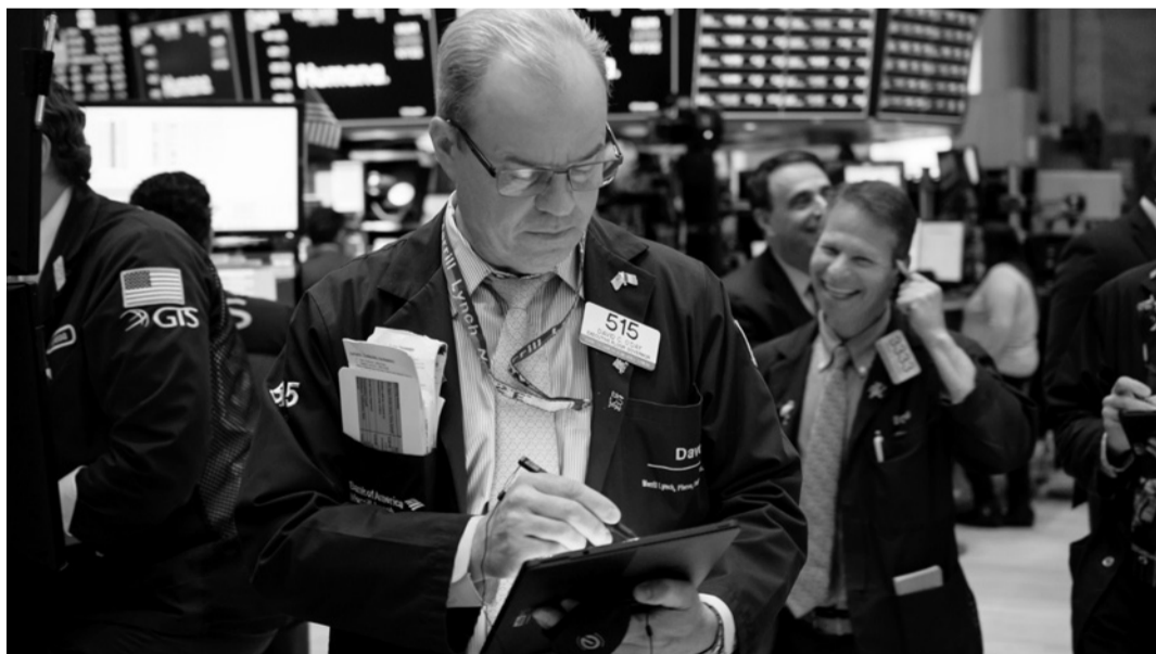
A trader works ahead of the closing bell on the floor of the New York Stock Exchange (NYSE)