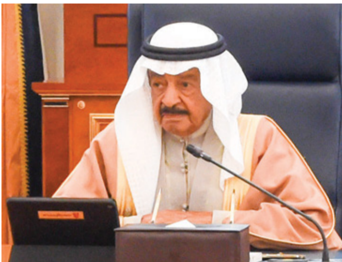
HRH the Premier chairs the Cabinet session.

He paid tribute to His Majesty King Hamad bin Isa Al Khalifa and His Royal Highness Prince Salman bin Hamad Al Khalifa, HRH the Premier and Crown Prince, Deputy Supreme Commander and First Deputy