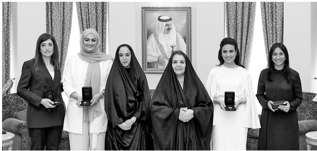
HRH Princess Sabeeka with award winners.

She underlined SCW's keenness to work within the nation-